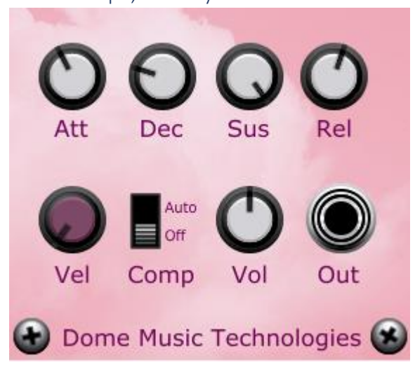
The Envelope, Velocity and Volume Control Section

Each voice channel features individually-articulated ADSR amplitude envelopes and individual velocity response. Attack, Decay and Release times can be varied between 1ms and 10 seconds. Velocity sensitivity (touch response) can be varied via the Vel knob - from flat (full volume, irrespective of key velocity) to fully dynamic (zero volume for softest touch, full volume for hardest touch). If the velocity socket is disconnected, all voices will sound at full intensity when triggered, irrespective of the setting of the Vel knob.