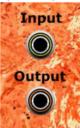
Input and Output Sockets

Kleiner-Kiffer is a strictly mono effect. It IS possible to run two in parallel to process left and right channels of a stereo signal independently. However, if you attempt this, it is strongly recommended that you use an external control voltage, rather than depending on synchronisation of the free-running internal LFOs.